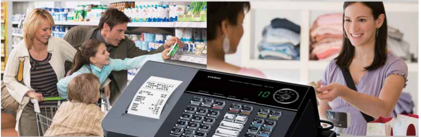
Small drawer model

The SE-S10 smart cash register combines convenience in setup and day-to-day operation with deluxe features such as a customer-friendly rear display and antimicrobial keyboard. This stylish, compact register suits any retail environment.